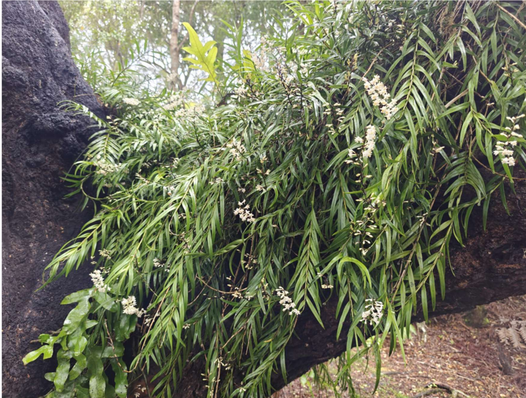
Korowai of Easter Orchids, East Harbour Park

NAUMAI, HAERE MAI! MALO E LELEI! TALOFA! 欢迎 (HUĀN YÍNG!)