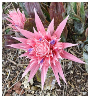
Bromeliad, Riddiford Gardens, March 2026