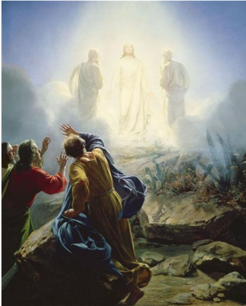
'Transfiguration of Jesus' by Carl Bloch

NAUMAI, HAERE MAI! MALO E LELEI! TALOFA! 欢迎 (HUĀN YÍNG!)