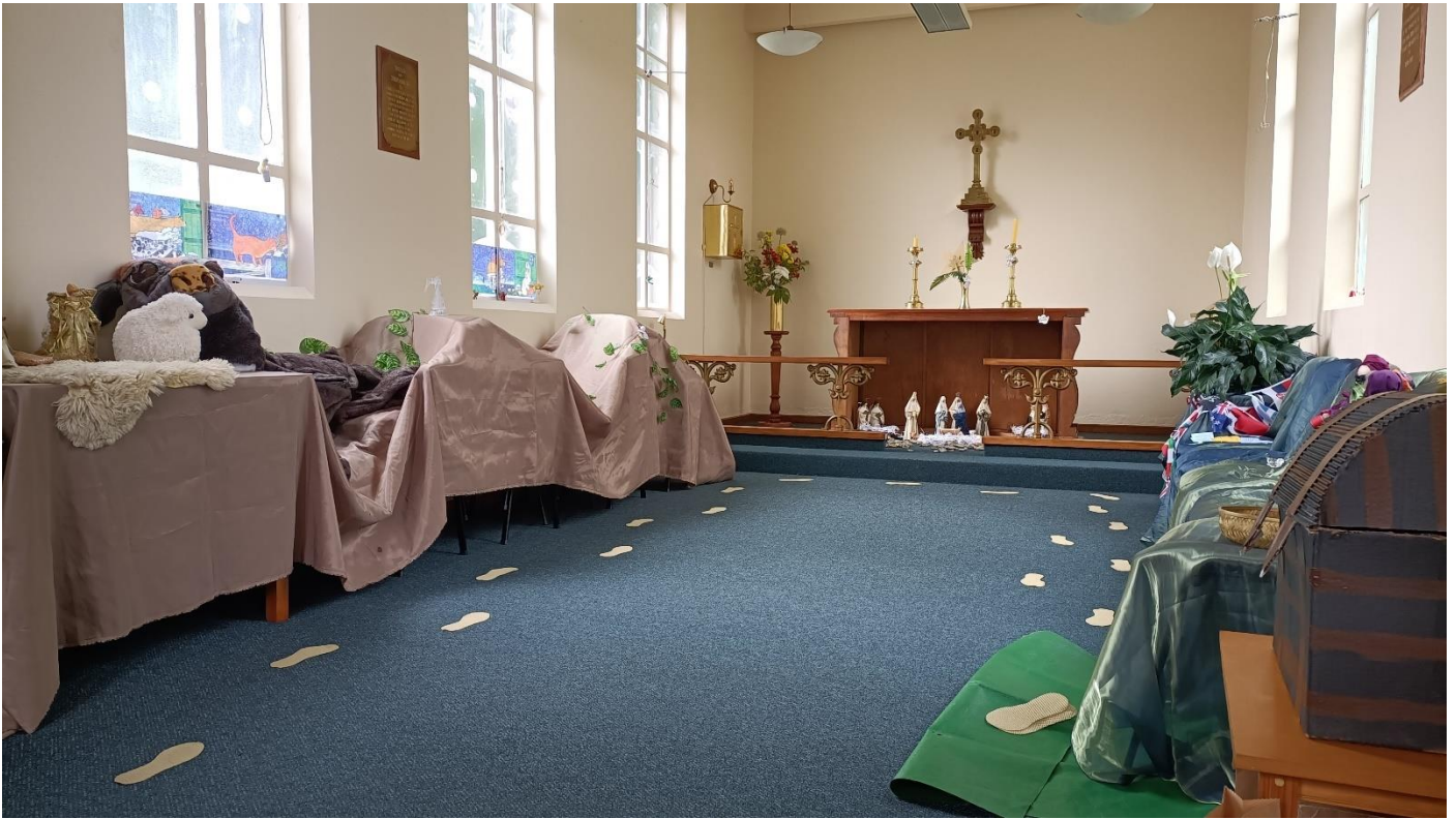
Chapel display for Christmas Eve Family Service