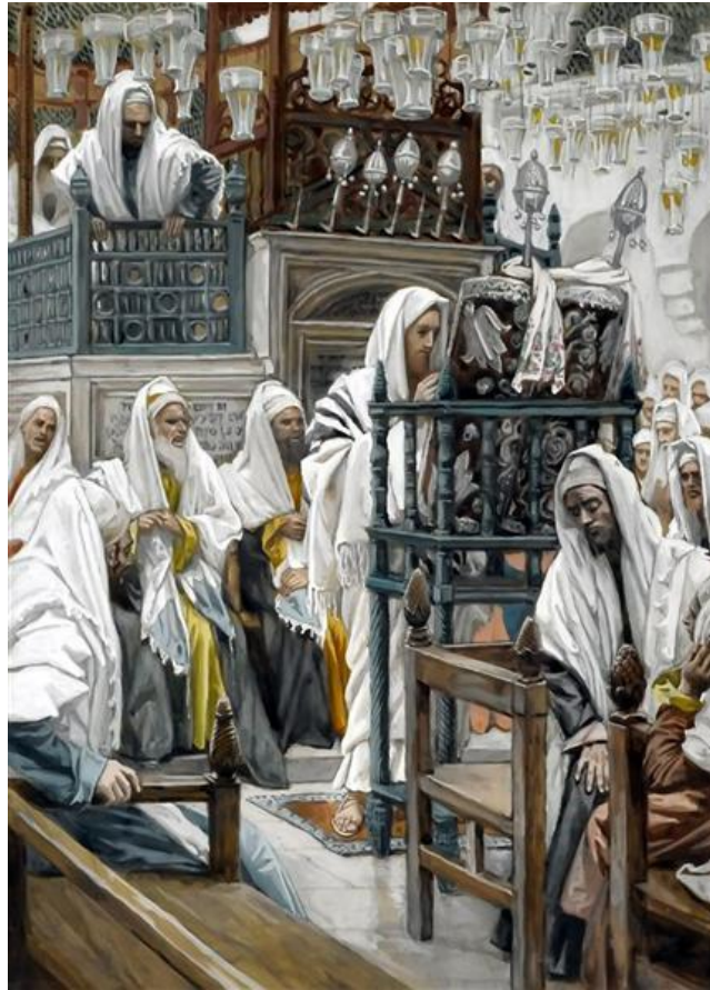
'Jesus unrolls the Book in the Synagogue' by James Tissot (1886-1894)

NAUMAI, HAERE MAI! MALO E LELEI! TALOFA! 欢迎 (HUĀN YÍNG!)