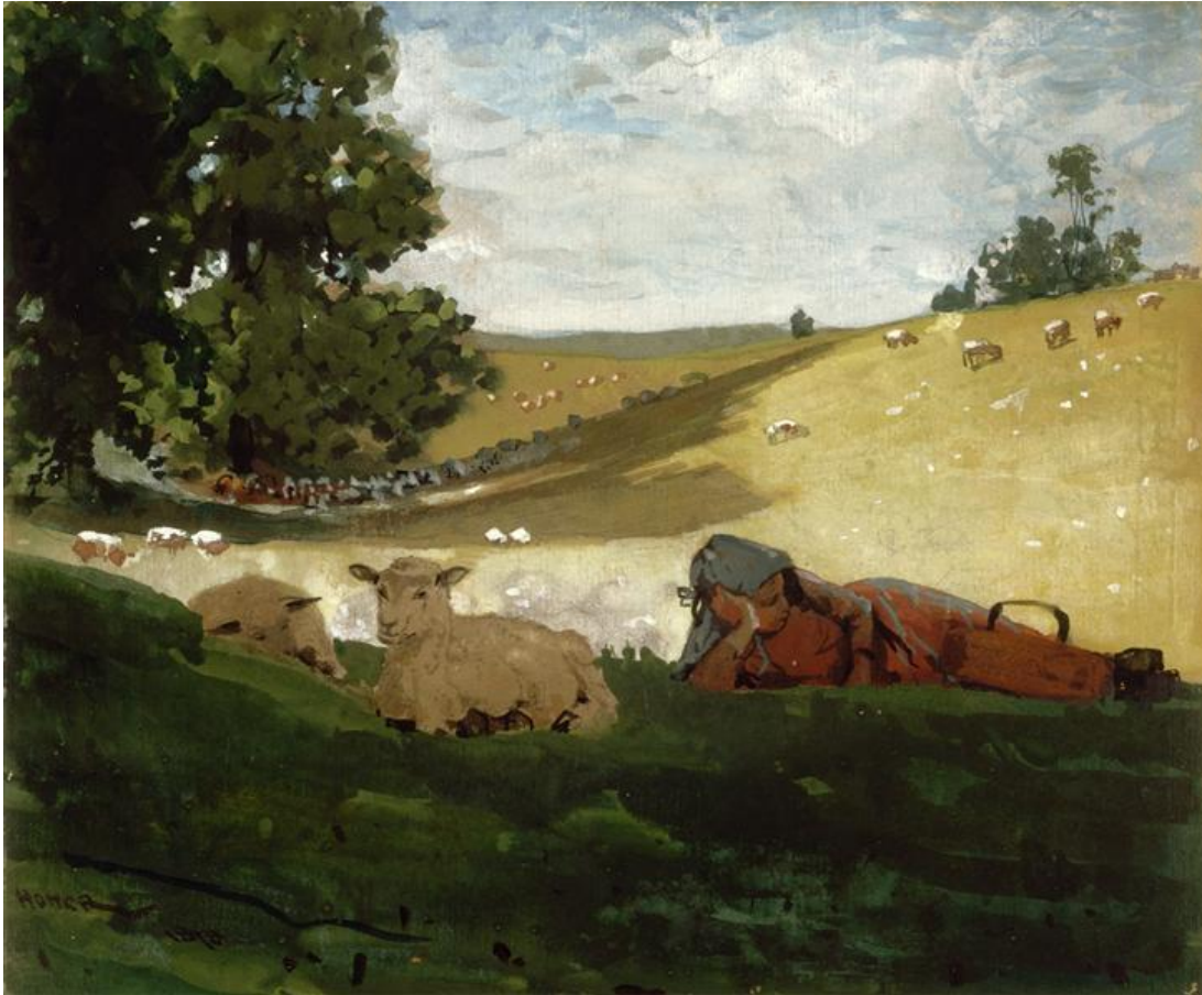
Photo credit: 'Warm Afternoon (Shepherdess)' by Winslow Homer, 1878

NAUMAI, HAERE MAI! MALO E LELEI! TALOFA! 欢迎 (HUĀN YÍNG!) Welcome all who are with us in person or online