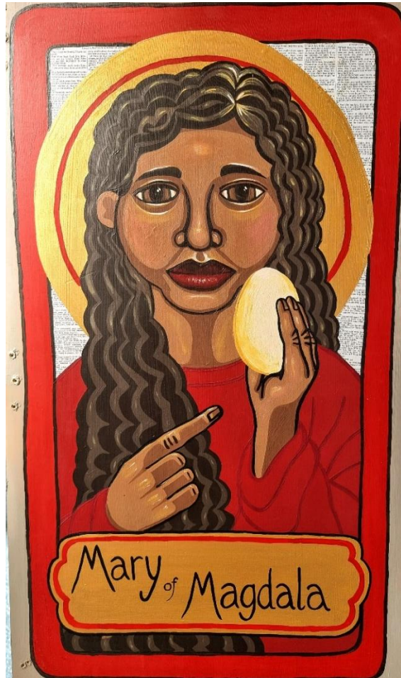
'Mary of Magdala'

NAUMAI, HAERE MAI! MALO E LELEI! TALOFA! 欢迎 (HUĀN YÍNG!) Welcome all who are with us in person or online