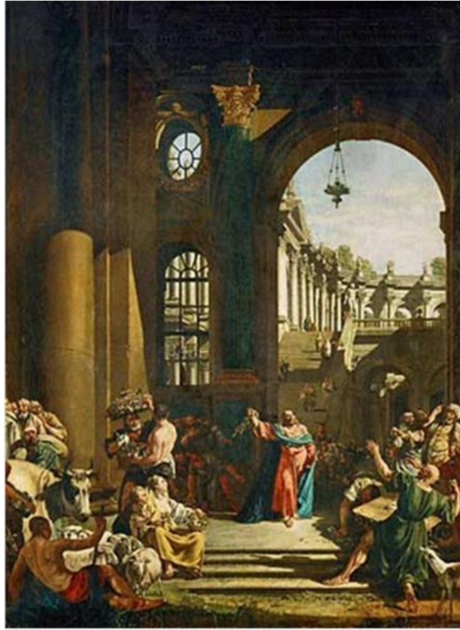
'Jesus cleansing the Temple' by Bernado Bellotto (1773)

NAUMAI, HAERE MAI! MALO E LELEI! TALOFA! 欢迎 (HUĀN YÍNG!)